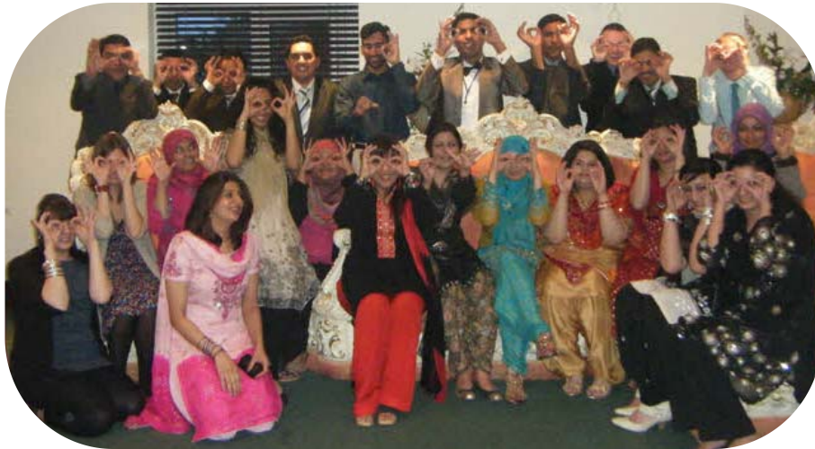
Above: Members of the Active Citizen programme.

Active Citizens is a worldwide programme run by the British Council which aims to deepen trust and understanding between communities. Participants become skilled in cross cultural communication and dialogue, and its role in community action.