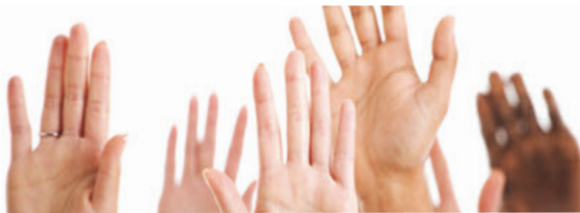
See page 4 for full story